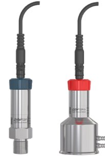
Gauge pressure Differential pressure