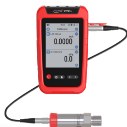
Additel 226Ex with ADT161Ex Pressure Module

Note: Precision Sensors (APXR) cannot be configured as an Ex model and cannot be read by Ex device.