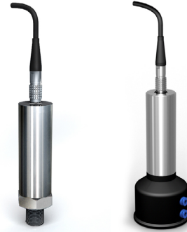
Gauge pressure Differential pressure