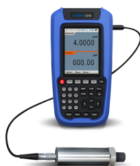
Additel 223A with ADT160A Pressure Module